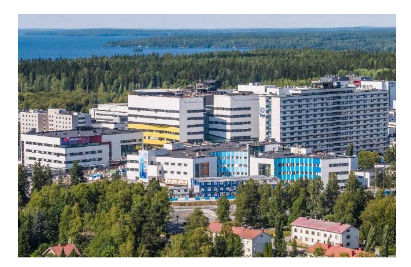
TAYS renovation programme, Pirkanmaa Hospital District, Tampere