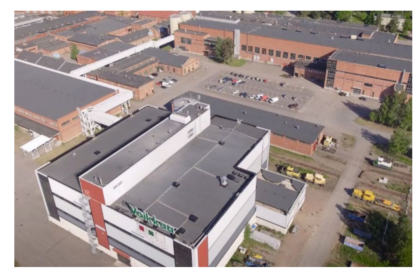
Voikkaa Factory Area, Redeve