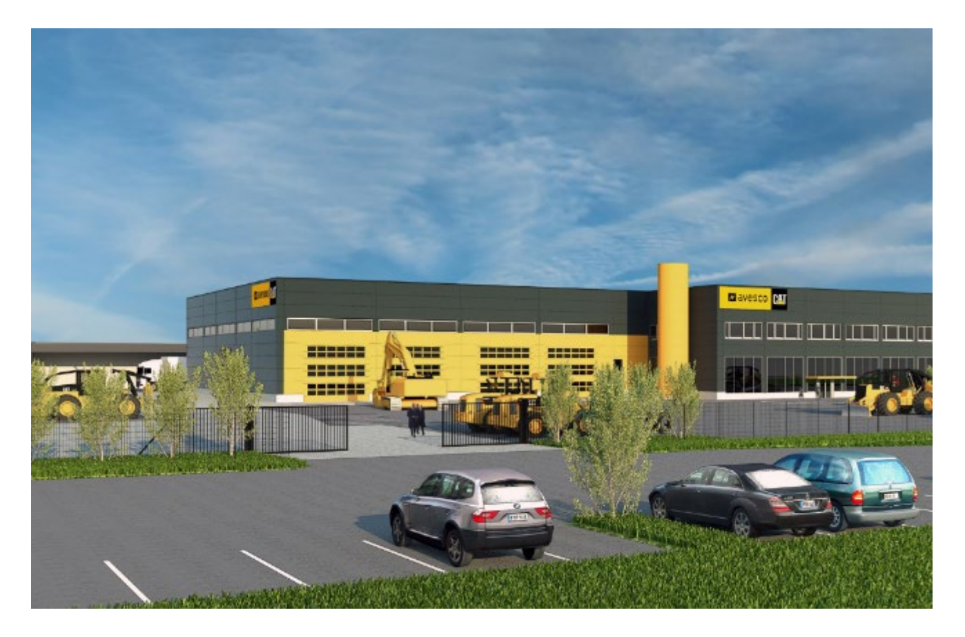
Caterpillar Maintenance Center, Kerava