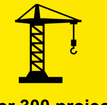
Over 300 projects currently in progress