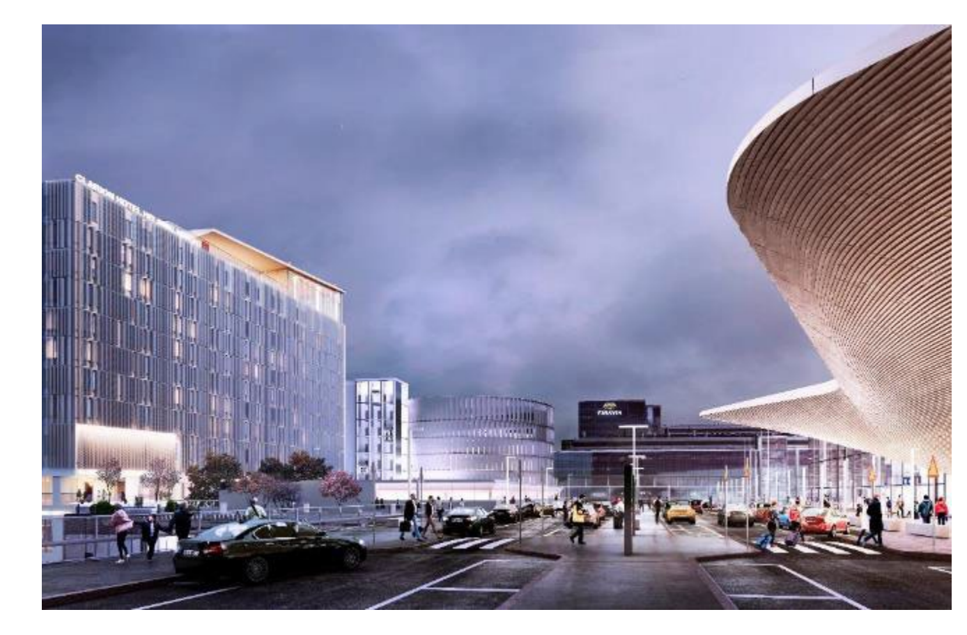
Airport hotel, AVIA Real Estate, Vantaa