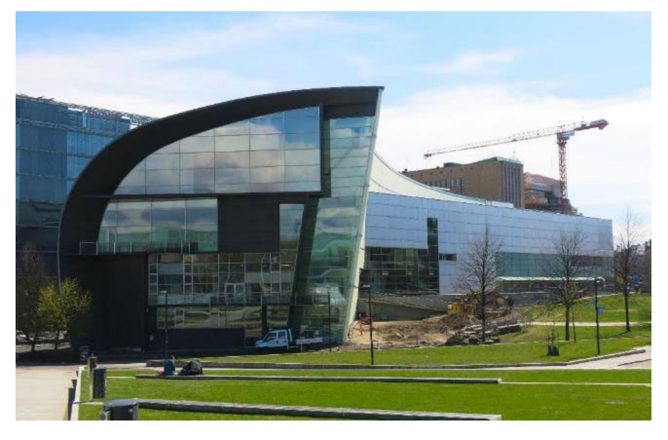
Kiasma, Senate Properties, Helsinki