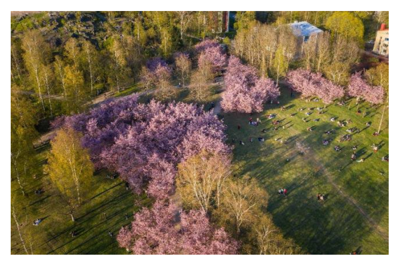
The Cherry Park in Roihuvuori, City of Helsinki, Helsinki