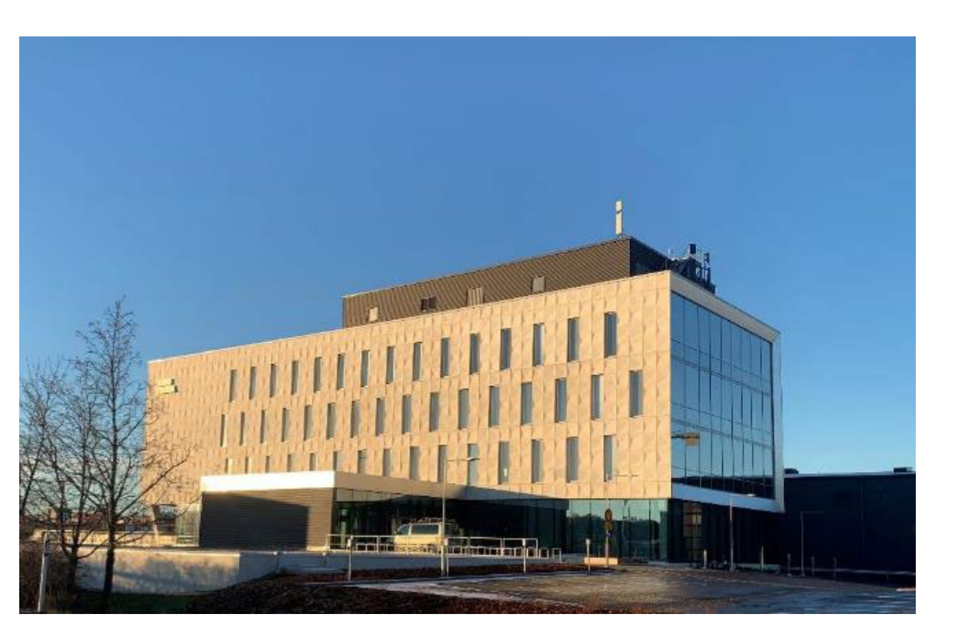
InfraCity, Turku Technology Properties, Turku