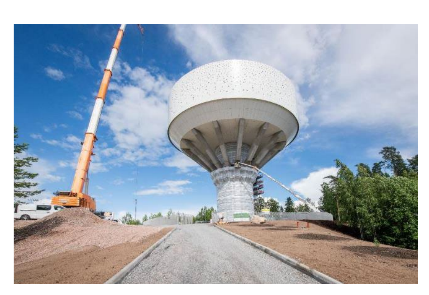
The water tower in Hiekkaharju, HSY, Vantaa