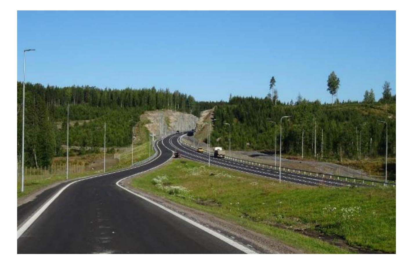
Lahti Southern Ring Road, Finnish Transport Infrastructure Agency