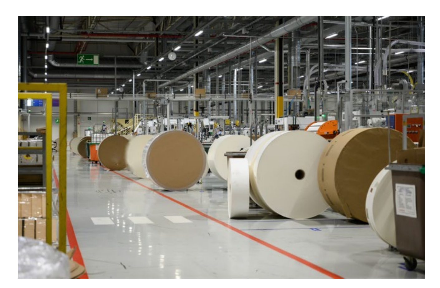
Huhtamäki Factory, NREP, Hämeenlinna