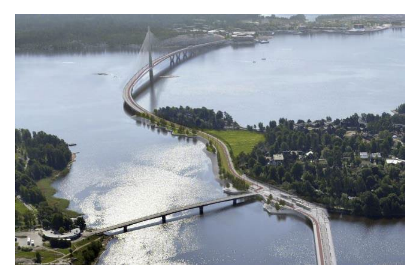
The Crown Bridges, City of Helsinki, Helsinki